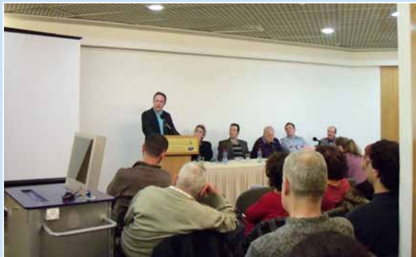
Prof. Elie Podeh's Lecture

The book makes an important contribution to the extant literature on the circumstances underlying the coalescence of the canonic document called the Pact of 'Umar in early Islam, outlining the status of non-Muslims. The findings discussed in the book reveal a dynamic picture of a legal and social construction which gradually developed over time, influenced by ancient as well as contemporary cultures and demonstrating active interaction between conquerors and conquered and between Muslims and non-